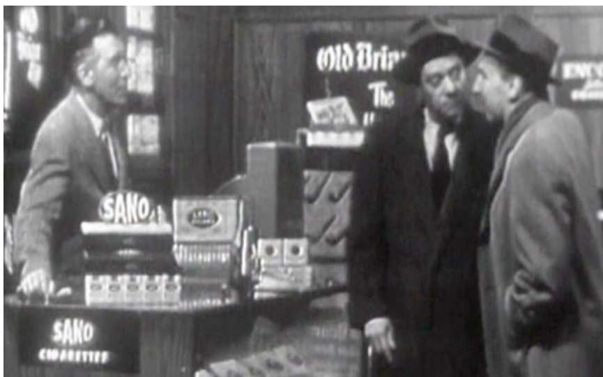
U.S. Tobacco products are ubiquitous in a scene from “Martin Kane, Private Eye.”